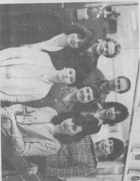
Our courteous friendly assistants