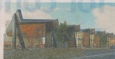
An artist's impression of Te Ramanui o Ruapūtahanga - Hawera's new civic centre.