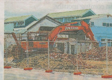
It took a few days to reduce the site to rubble.