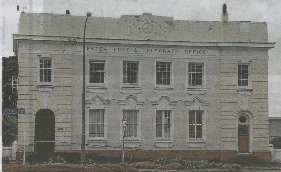
The former Pātea Post Office has been sold after about five years on and off the market.

"I think, from a somewhat more philosophical view on it, that New Zealand is not an old country in terms of