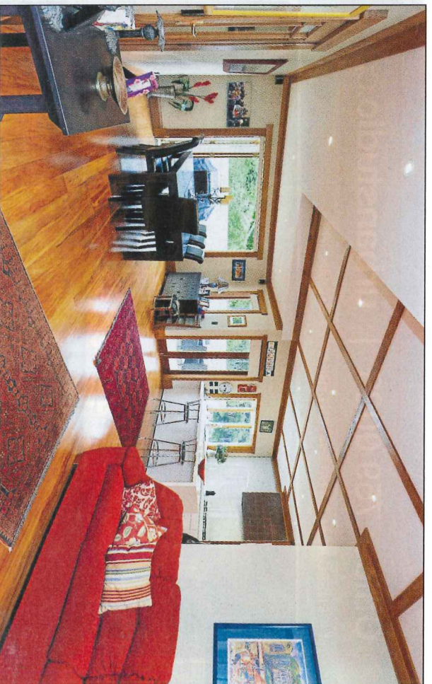
Rimu warmth: Original character flows through this city heritage home, and is carefully complemented by new kitchen and family areas.