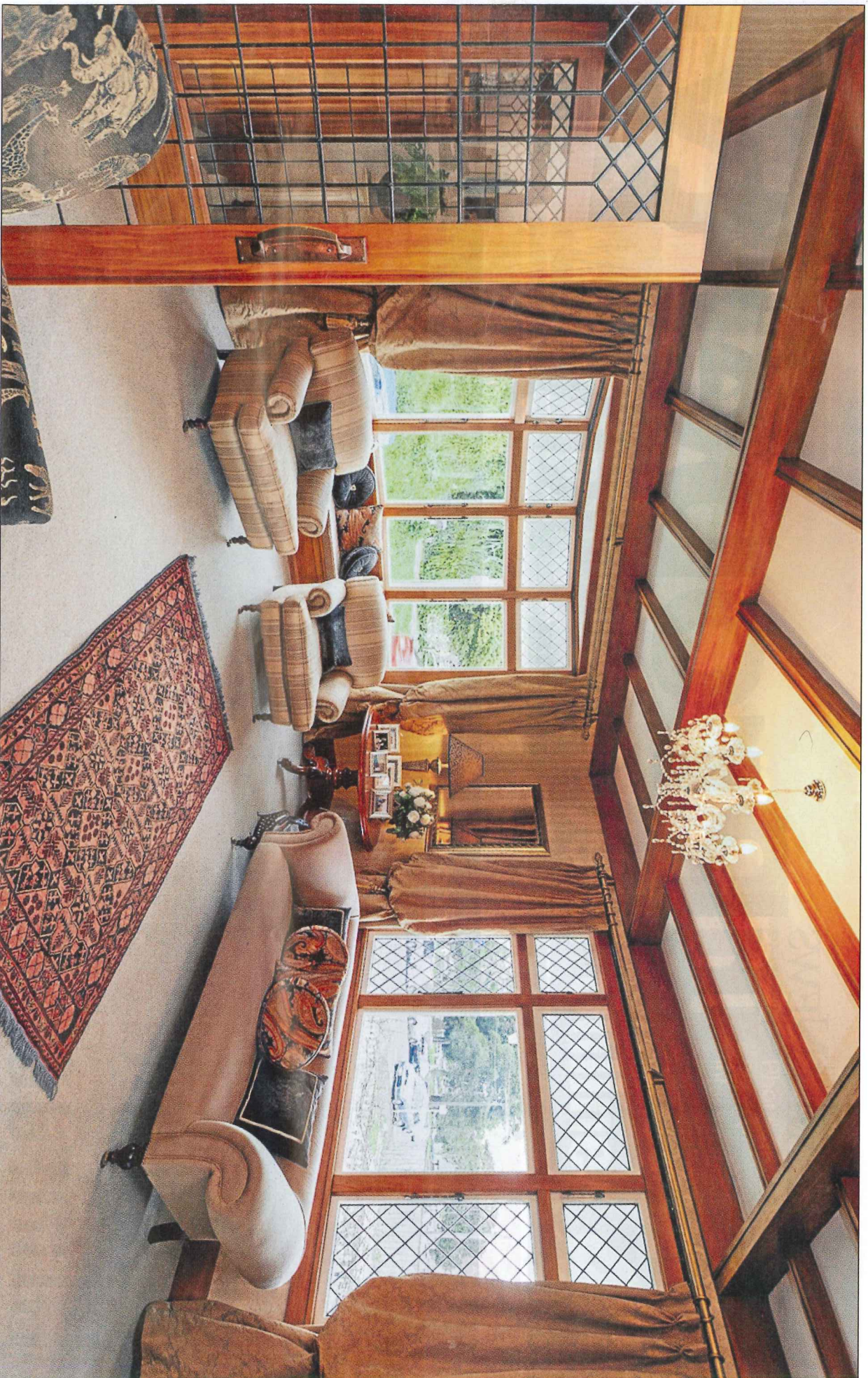
Brougham beauty: This central city residence features a wealth of original character, finely refinished and complemented by modern convenience and comfort.