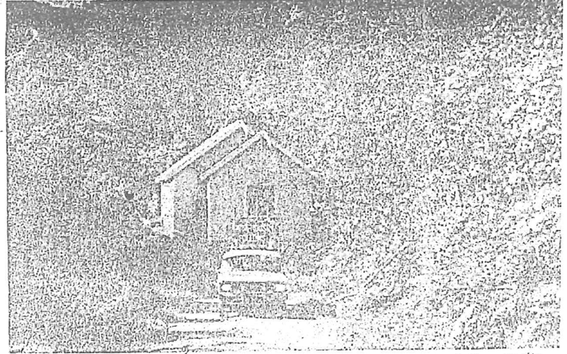
The church moves along the Mimi Road stock route on its way to the new site.