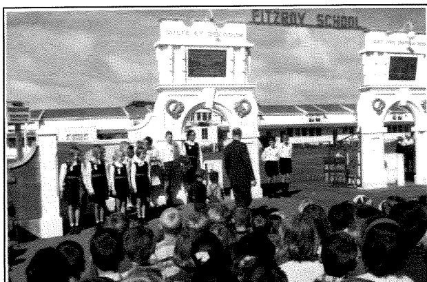
Anzac Day Service 1967

A ceremony was held by the school for Anzac Day for many years and a wreath laid by pupils. A service was usually held on the day before Anzac Day in the Hall, with a guest speaker, the children then all walked to the gates.