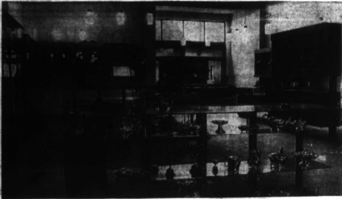
A general interior view of the new shop showing its spaciousness and appealing display aided by modern lighting. Only half the shop was here photographed.

Jewellery is an intimate thing and its purchase requires contemplation and privacy. Our new spaciousness achieves this as well as giving better display in delightful modern fixtures and making shopping easier for more people. The privacy of space is truly modern — your discussion with our staff will be a confidential one.