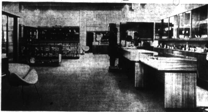
THE INTERIOR of Dalglish's Jewellery shop showing the spacious display area, up-to-date fittings and special lighting. The new shop has been designed for customer comfort with uncrowded viewing.