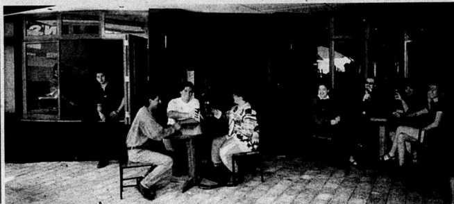
A LA SIDEWALK: The frontage of The Thirsty Bull is set back for outdoor relaxation.