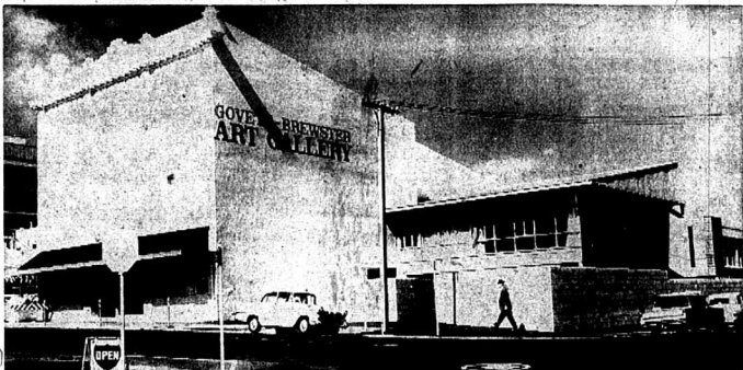
THE GOVETT-BREWSTER ART GALLERY, which has been described as one of the finest galleries in Australasia. At the left is the main part of the gallery (formerly the Regent Theatre), bright in new paint and with a vivid blue veranda. At right are the extensions, fronted by the outdoor sculpture court.

Eleven companies sponsoring the exhibition have given money and lent a considerable amount of equipment.