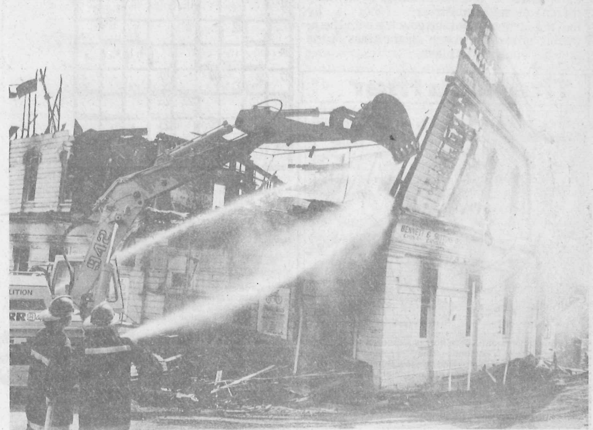
Demolition contractors (above) tear down the remains of the two-storey New Plymouth building early this afternoon to allow firemen access to the burning interior. Below: Firemen stand by with hoses as the Brougham St wall of Bennett and Sutton Ltd's premises is torn down.

Police said an early estimate of property damage in the Barossa Valley alone is $NZ4.2 million but is expected to be several million dollars more when agricultural losses are added.