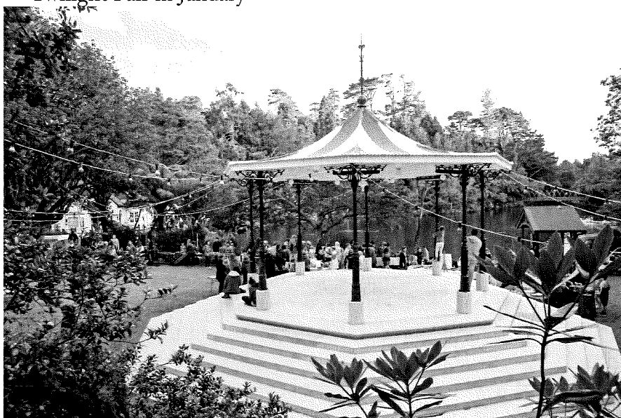
The Band Rotunda 2014 Twilight Fair in January