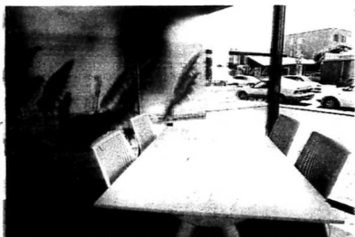
Meeting rooms near reception are conveniently placed for clients.