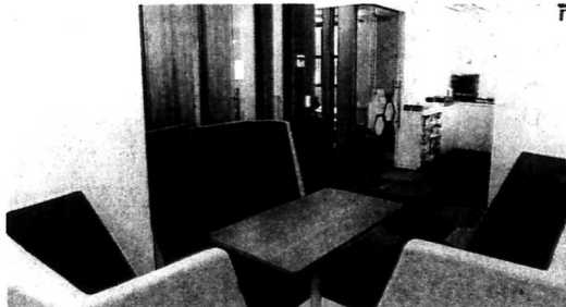
Funky furniture is set up for a casual conference area.