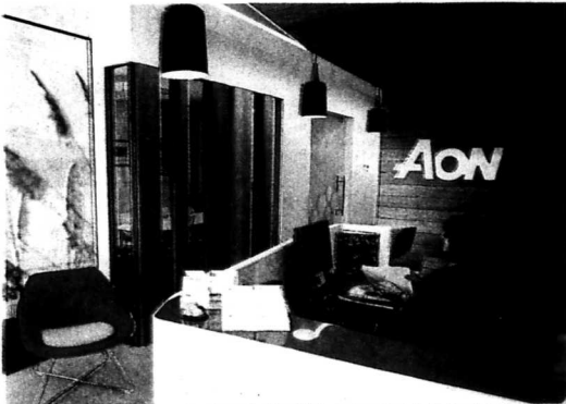
A light and appealing reception area is customer-friendly, while staff enjoy natural light and an efficient layout in their work area.