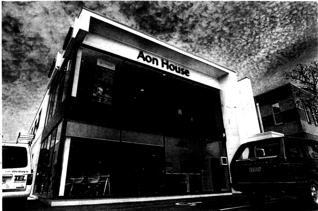
Aon House at 9 Young St in New Plymouth is the new home for Aon Insurance.