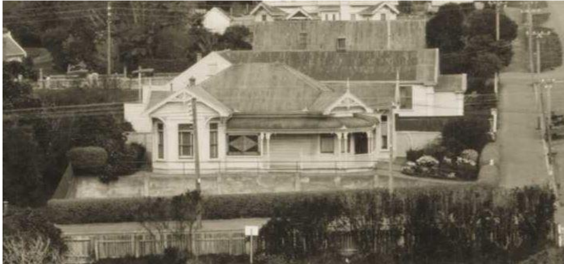
Davie House prior to 1927 additions. Detail from 1923 view of New Plymouth township with Devon Street in the foreground from NZI Building.