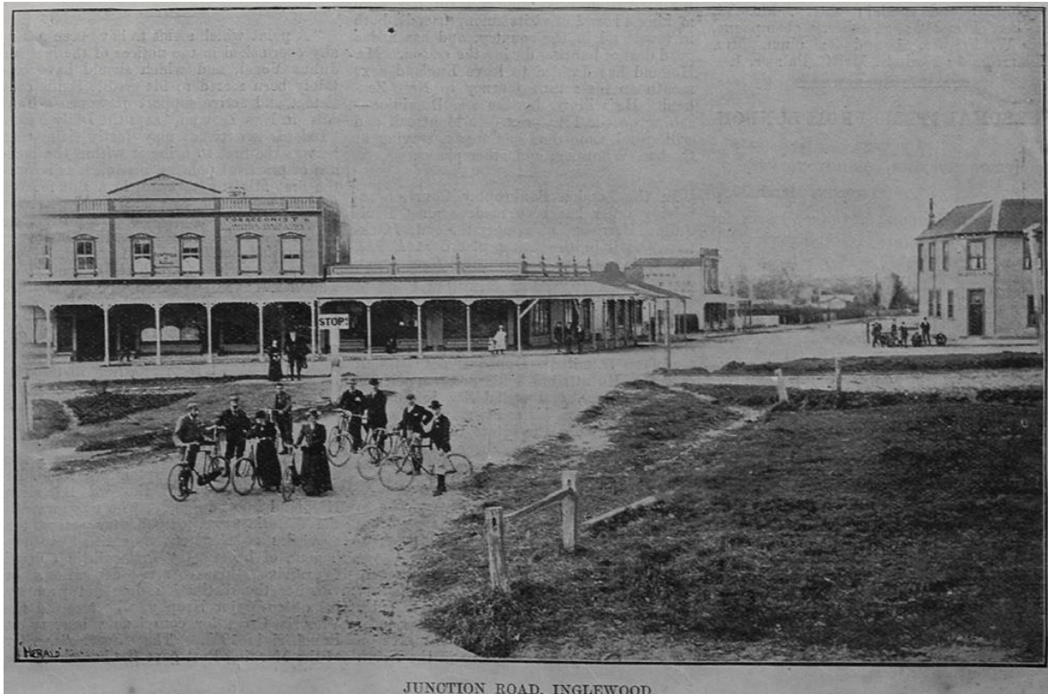
Intersection of Moa and Rata Streets circa 1899, with Railway Hotel at right prior to Sanderson additions.