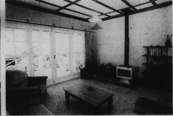
LOUNGE: French doors and windows offer views; woodburner provides heat.