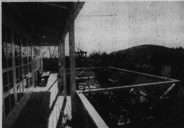
GARDENS: Once a paddock, now a relaxing area of plants and lawns.

● Price: $290,000. Marketed by Taranaki Farmers Real Estate, Inglewood.