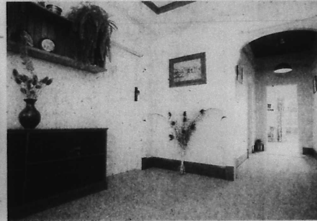
STYLE: Roomy entry foyer has character features.